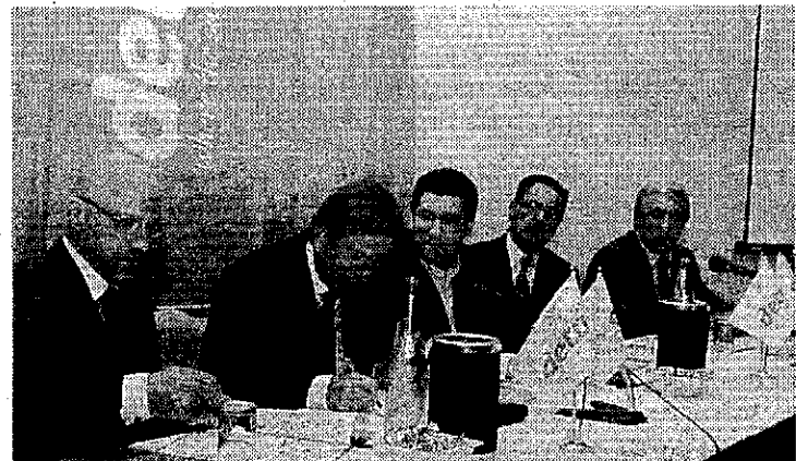
During the signing of the sponsorship agreement between Detur and The Malta Basketball Association